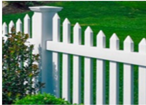
CONTEMPORARY SCALLOPED with pointed picket tops