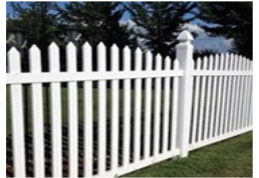
CONTEMPORARY ARCHED with pointed pickets