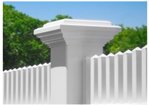
6" POSTS for majestic lines and entrances