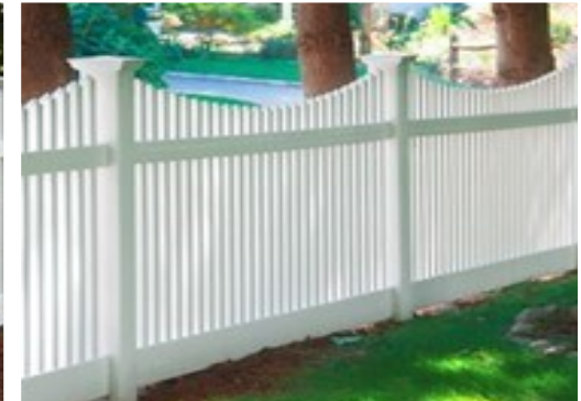
SCALLOPED VICTORIAN is a majestic design