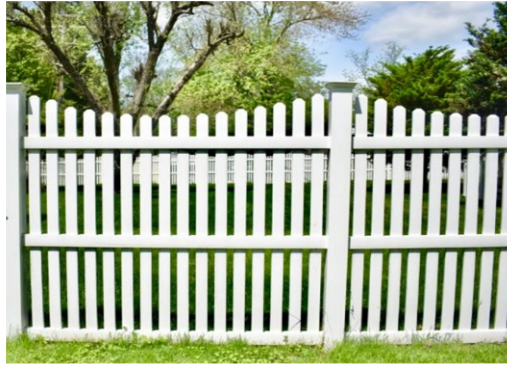
TALL PICKET shown in scalloped contemporary