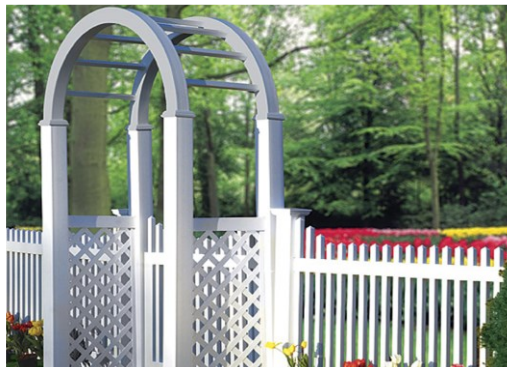
ARBORS in 2 and 4 post designs