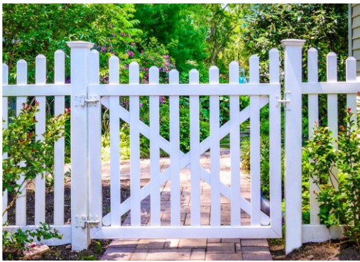
WELDED GATES for added strength and model-matched