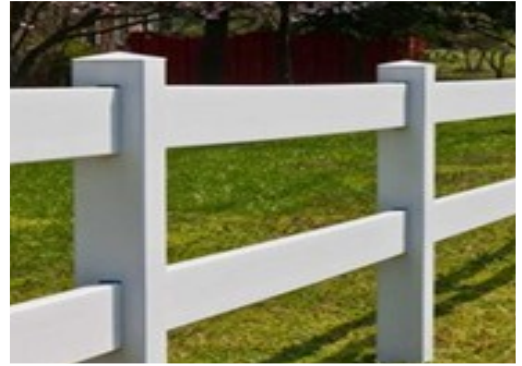
2-RAIL RANCH 3.0' and 4.0' H