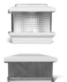
SOLAR / LED