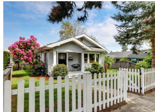
3.0 H CONTEMPORARY PICKET ideal for entrances to smaller homes