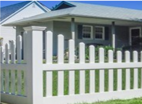
CONTEMPORARY YARD CORNER reduced from 4.0' to 3.0'