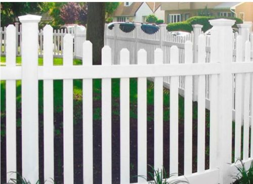
CURVED CORNER in Contemporary picketing