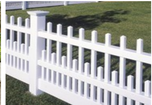
VICTORIAN ALTERNATING PICKET creates a unique profile