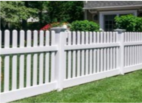
CONTEMPORARY STRAIGHT TOP with dog ear picket

All styles can be customized with a variety of posts caps, post sizes, gate configurations and add-ons such as arbors or pergolas.