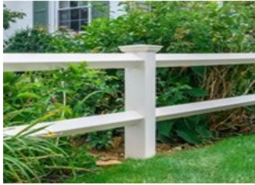
DIAMOND RAIL in 2 and 3-rail models