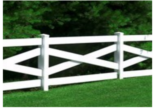
CROSSBUCK for a distinguished look