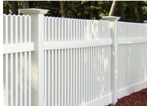
VICTORIAN STRAIGHT TOP with New England post caps