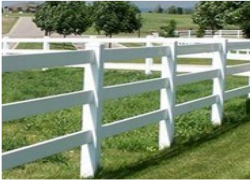
3-RAIL RANCH 4.0' and 5.0' H